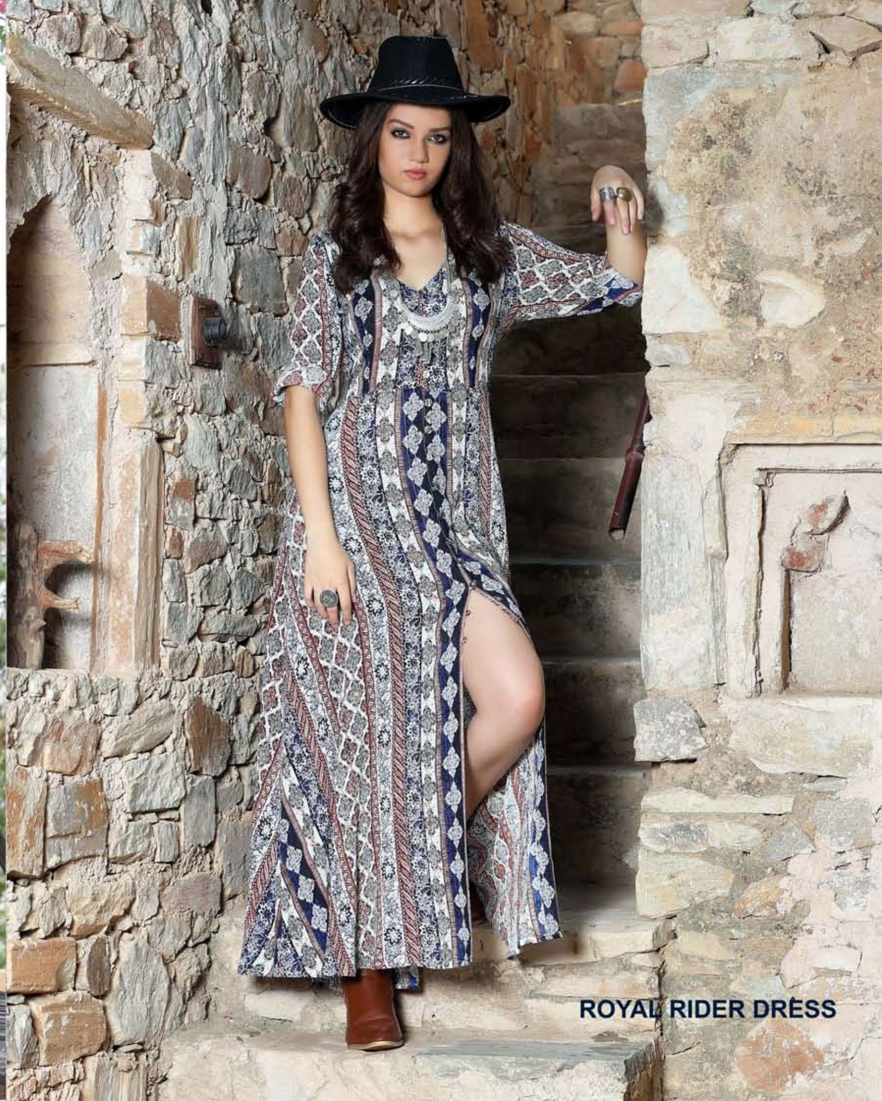
ROYAL RIDER DRESS